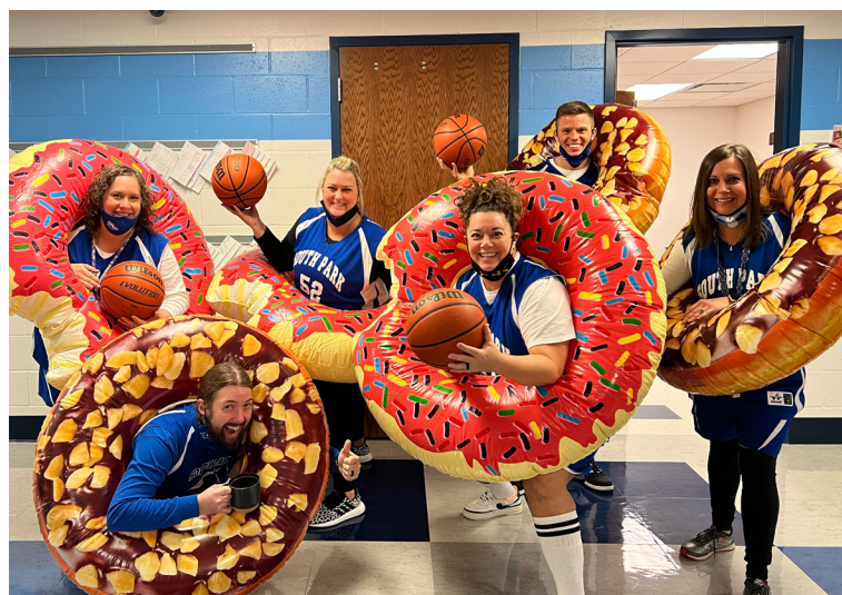
They're the Dunking Donuts!

The sixth grade team dressed the part for the middle school's Red Ribbon Week. This was what they looked like on "Dress Like a Friend Day." Can you guess what they're dressed up as?